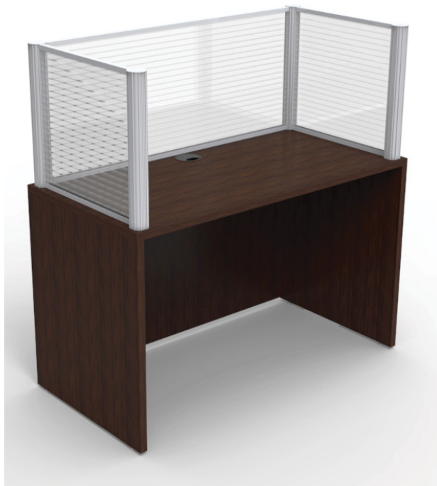
SC100-4224 - laminate base