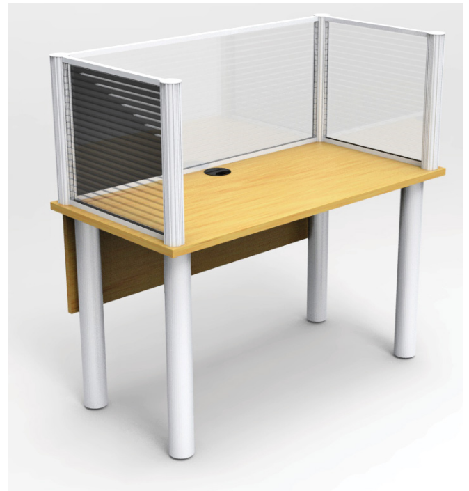
SC200-4224 - post legs